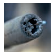
Welding nozzle without HeBoCoat® welding coating.