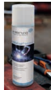
HeBoCoat® welding in use.