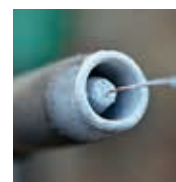
Welding nozzle with HeBoCoat® welding coating.